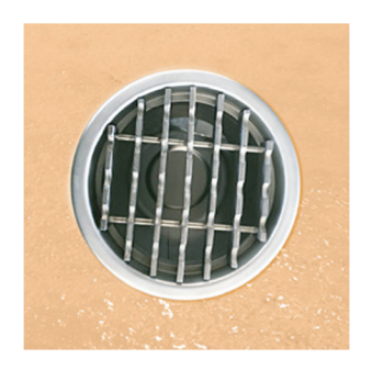
Circular Outlet Box

Installation brackets, spaced 20 inches apart, ensure stability of the slot channel during installation. They are easy to remove after installation.